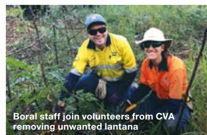
Boral staff join volunteers from CVA removing unwanted lantana

In FY2018, we celebrated 15 years of partnership with Bangarra Dance Theatre (Bangarra), an Aboriginal and Torres Strait Islander organisation and one of Australia's leading performing arts companies. As the regional touring partner, we are working with Bangarra to bring inspiring performances, which blend traditional Aboriginal and Torres Strait Islander history and culture with international contemporary dance, to audiences in regional communities around Australia.